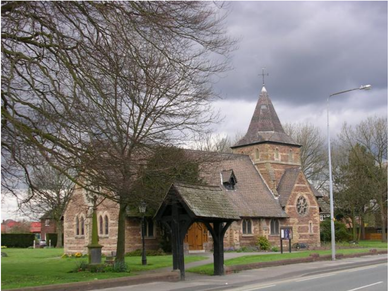
St. John the Baptist Churchyard, Irlam

St. John the Baptist Churchyard, Irlam, Manchester, Lancashire contains 5 Commonwealth War Graves, only 1 from World War 2.